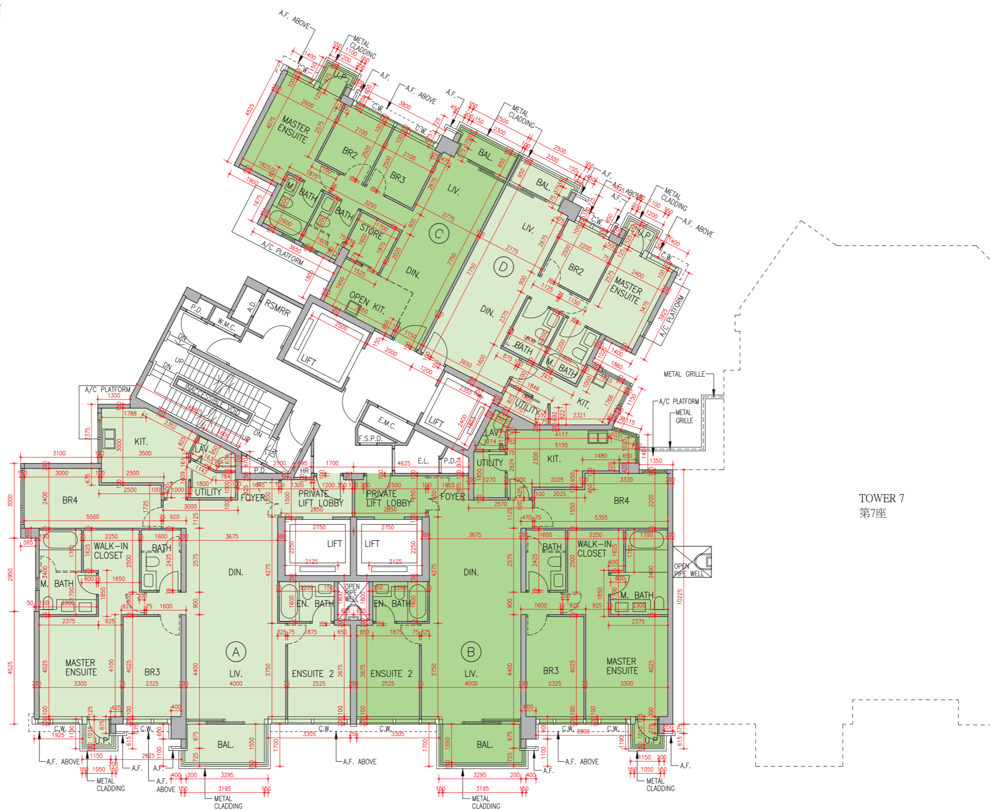
TOWER 7 第7座